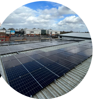
Solar Panels Installation