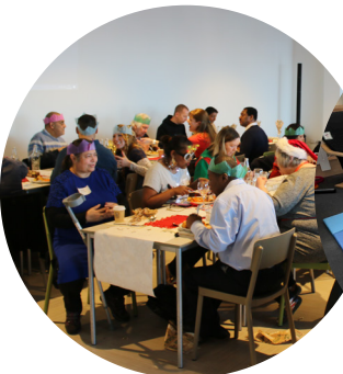
Christmas Day Lunch