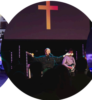
Cause to Live For 2022