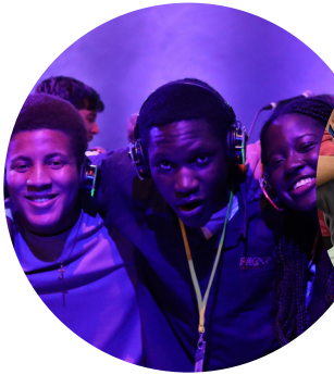
DTI Roadtrip 2023