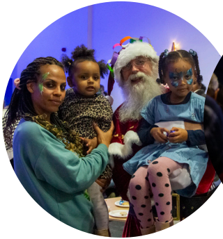
Storehouse Christmas Party