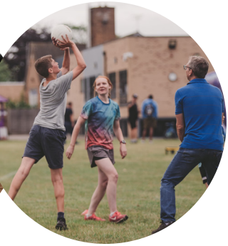
Summer fun Staines