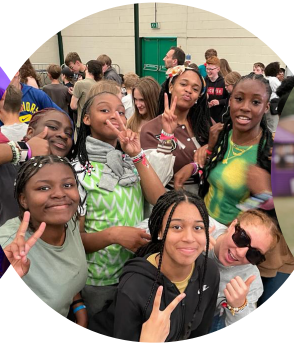
DTI summer 2023