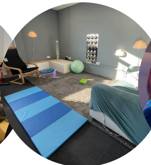
Additional needs projects