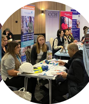
Job Club / Job Fair / Money Advice Centre